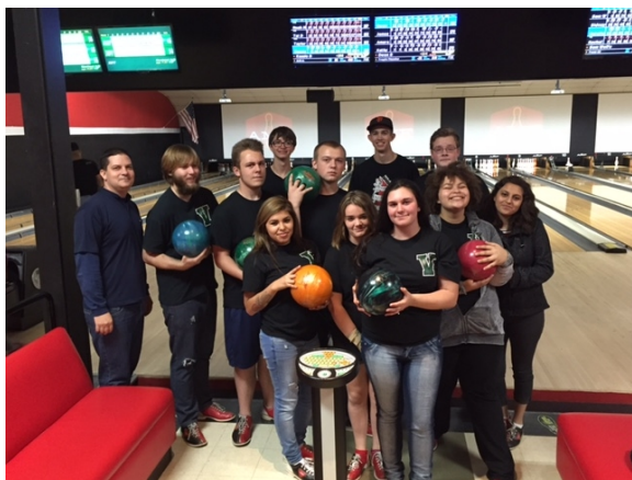
Victory High School's Bowling Team