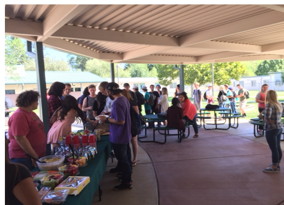
Students attending the ASB School BBQ

The Associated Student Body (ASB) got to hold a BBQ for all students of Victory to bring friendships closer, or maybe create a few new one's. Although most of the students only went for the great food, what's really important is the preparation behind the grill.